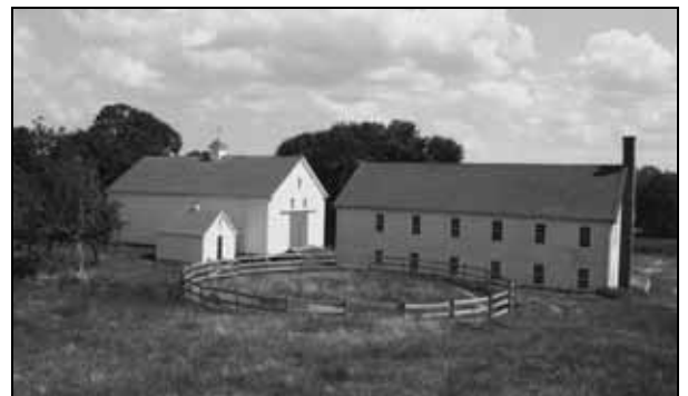
Wright-Locke-Hamilton Farm – 1915 Squash House (right), c. 1900 Ice House (left front), and 1827 barn (left rear).