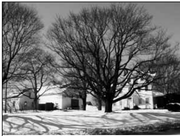
Wright-Locke-Hamilton Farm – 1828 farmhouse (right), 1827 barn (center), and c. 1900 carriage shed (left).

While the farm includes eight historic buildings and 20 acres of land, it is far more than the sum of its parts. It is a "Heritage Landscape" wherein the buildings and the land are inextricably wed, and their significance cannot be separated. Heritage Landscapes are of such importance to the Commonwealth of Massachusetts that they are the subject of a current state-wide Heritage Landscapes Initiative Program through the Massachusetts Department of Conservation and Recreation (DCR) to encourage local communities to identify and protect these important pieces of our history and our common wealth. In their publication Reading the Land, Massachusetts Heritage Land-