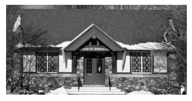
The Society held its 2010 holiday party at the Eunice Thompson Memorial Library in North Woburn.

January - March 2011 Black Horse Bulletin