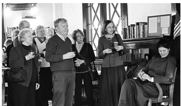
Society members listen to the remarks on the Thompson Library and North Woburn event.